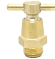
Air Cock 1/4" Code : SIACA_ACO002