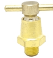
Air Cock 1/8" Code : SIACA_ACO001