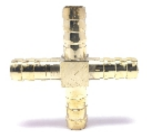
Brass Four Way Joint Code : SIACA_BJ003