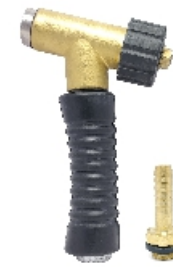
Car Washing Gun Code : SIACA_MIC001