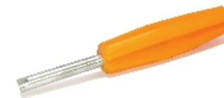
Screw Driver Valve Core Standard Code : SIACA_VRT007