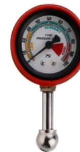
Air Pressure Gauge With Air Chuck Code : SIACA_PG001