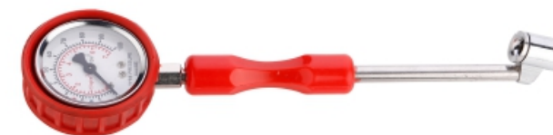
Air Pressure Gauge With TTC Code : SIACA_PG003