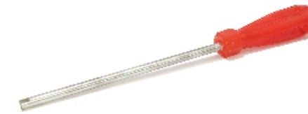
Screw Driver Valve Core Long Code : SIACA_VRT005