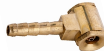
Two Way Air Chuck