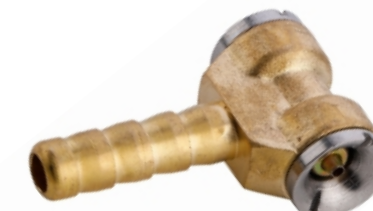
Two Way Air Chuck Nozzle Forging