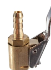
Air Lock Nozzle Light