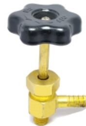
Wheel Valve Heavy