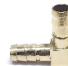
Brass L Joint Code : SIACA_BJ004