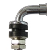
Tubeless Valve 8mm With Chromed Locking Nuts Code : SIACA_TTV006