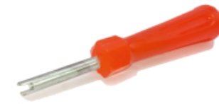
Screw Driver Valve Core Light Code : SIACA_VRT001