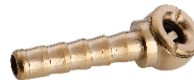
Single Way Air Chuck