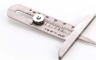
Tyre Depth Gauge 0-50 mm