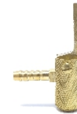
Foot Pump Nozzle Heavy Code : SIACA_MIC002