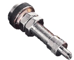
Motorcycle Tubeless Valve Chrome Plated Code : SIACA_MIC006