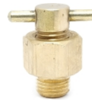
Air Cock Nut Type 1/4" Code : SIACA_ACO004