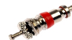
Two Piece Valve Core Code : SIACA_TTV008