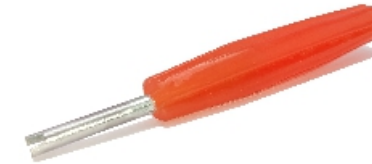
Screw Driver Valve Core Heavy Code : SIACA_VRT002