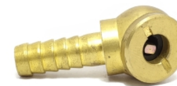
Single Way Heavy Air Chuck Short 10mm