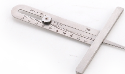
Tyre Depth Gauge 0-100 mm