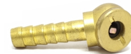
Single Way Heavy Air Chuck 10mm