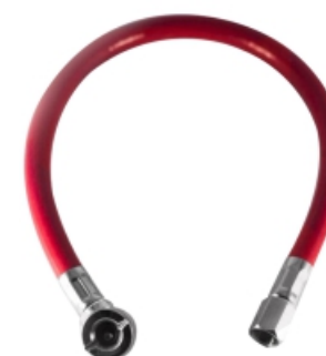
Hose with Air Chuck