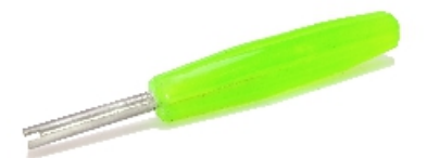
Screw Driver Valve Core Code : SIACA_VRT006