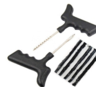
Tyre Puncture Kit Code : SIACA_TTR001