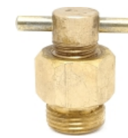
Air Cock Nut Type 3/8" Code : SIACA_ACO005