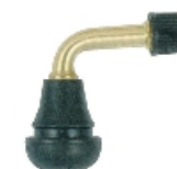
Tubeless valve Activa Code : SIACA_TTV007