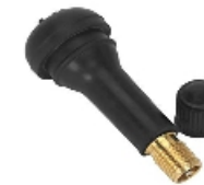
Tubeless Valve TR414 Code : SIACA_TTV002