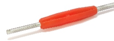
2 in 1 Valve Die Code : SIACA_VRT004