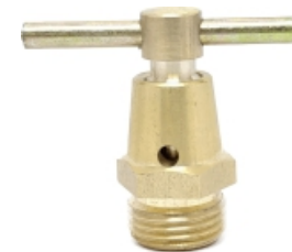
Air Cock 1/2" Code : SIACA_ACO007