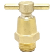
Air Cock 3/8" Code : SIACA_ACO003