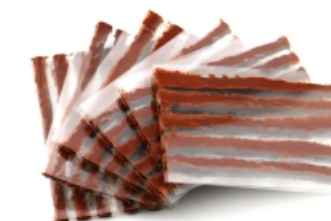
Puncture Repair Strips Code : SIACA_TTR002