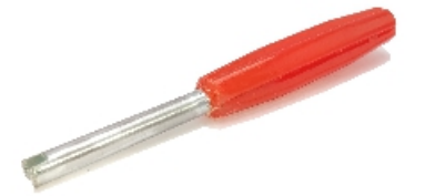
Screw Driver Valve Core Medium Code : SIACA_VRT003