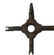
4 Way Die Heavy Code : SIACA_VRT010