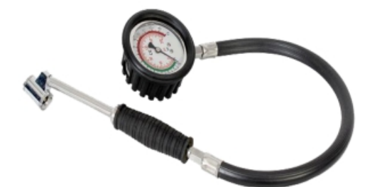
Air Pressure Gauge With Hose & TTC Code : SIACA_PG004