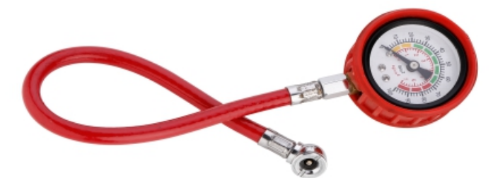
Air Pressure Gauge With Hose & Air Chuck Code : SIACA_PG002