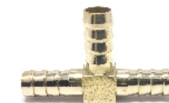
Brass T Joint Code : SIACA_BJ002