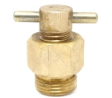
Air Cock Nut Type 1/2" Code : SIACA_ACO006