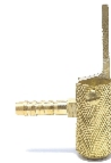
Foot Pump Nozzle Light Code : SIACA_MIC003