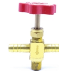
1/4" Wheel Valve With Double Nozzle